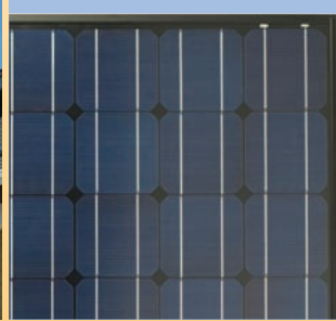
Laminated glass construction in a high torsion frame.